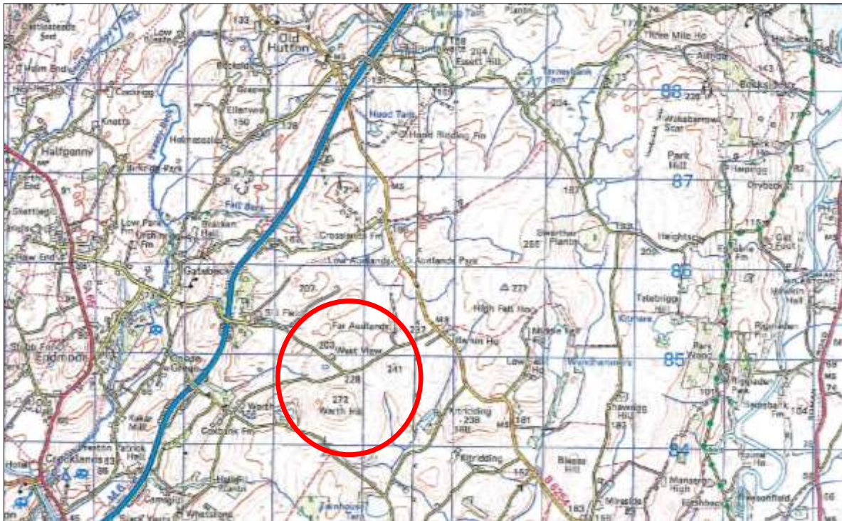
Plans reproduced from the Ordnance Survey Plan with the permission of the Controller of H.M. Stationery Office. Licence No. 100004708