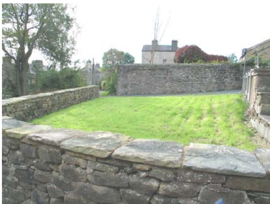
Enclosed Lawned Garden Area

Private parking area and enclosed lawned garden area to the front. Path and grassed area to the side. Cold water tap, paved patio, grassed area and gated private parking area to the rear.