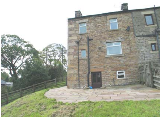
Paved Patio And Grassed Area