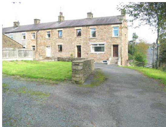
Private Parking And Enclosed Lawned Garden Area